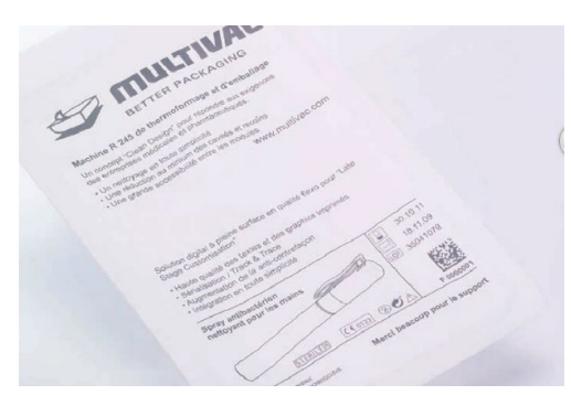
Medical Device package with Tyvek® lidding